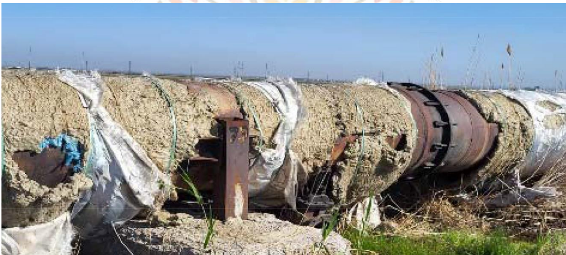
Figure 1. Factors causing loss of hot water from heat sources to the population

We know that there are heat losses in pipes when hot water comes from heat sources to the population. We can see this in Figure 1 below