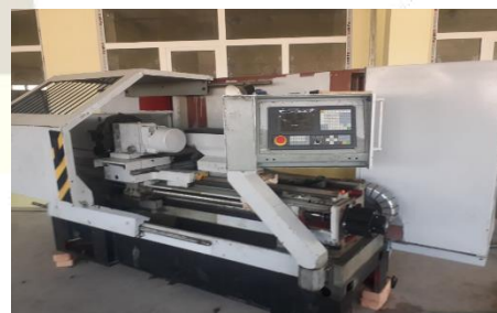
Figure.2 New and old panel management of the machine