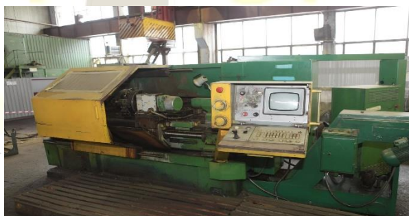
Figure.1 16K20F3 Lathe - screw cutting machine CNC

Such upgrades are useful for small and medium-sized businesses, because they allow to have a minimum number of machines with many different processing methods in their composition. This direction was developed in our master's thesis. Work subject is the modernization of the 16K20F3 CNC machine tool to the turning-milling CNC machine tool.